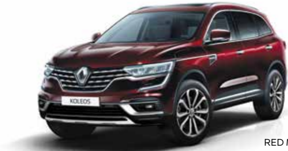
RED MILLESIME (MP)

Note: Printing limitations do not permit subtle paint shades to be shown with complete accuracy.