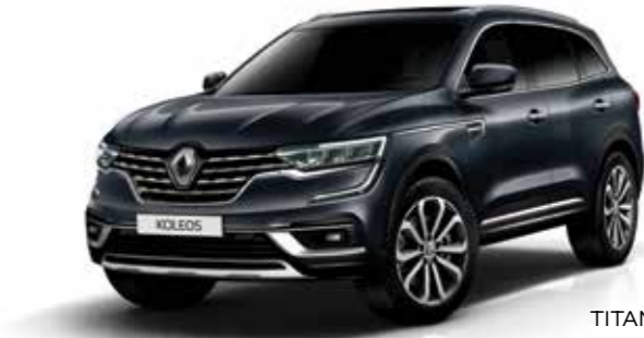
TITANIUM GREY (MP)