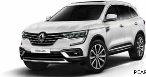
PEARL WHITE (MP)