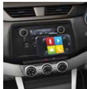
R&Go® radio with additional accessory smartphone mount