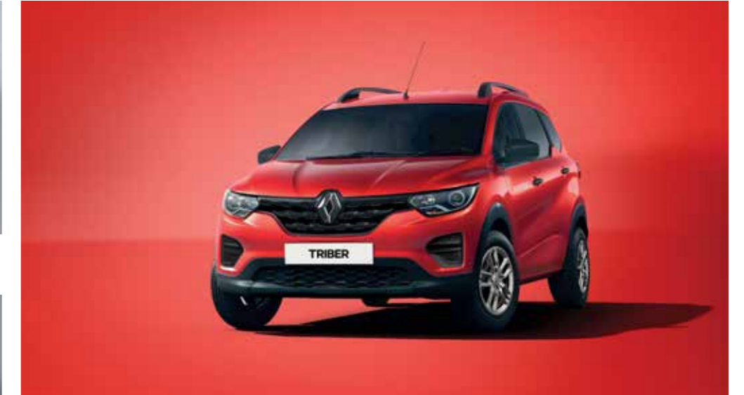
FIERY RED (MP)