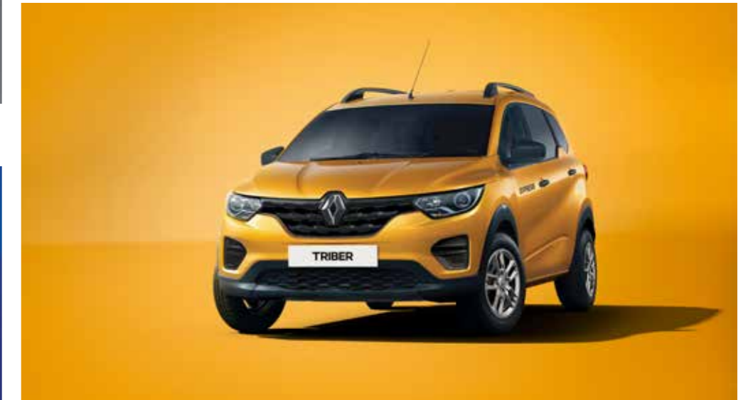
HONEY YELLOW (MP)

NM: Clearcoat Opaque; MP: Metallic Paint