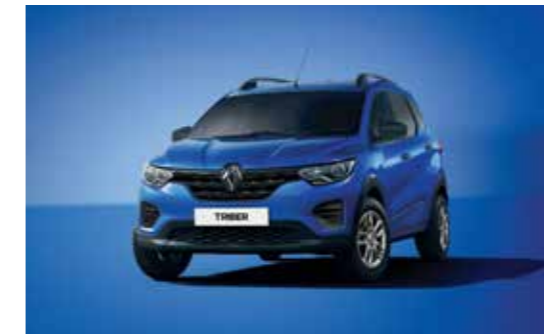
ELECTRIC BLUE (MP)