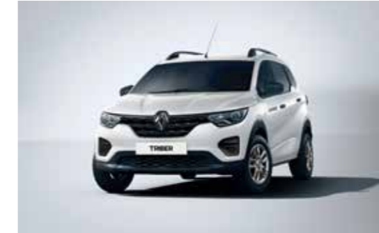
ICE COOL WHITE (NM)