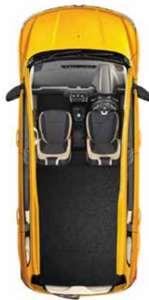
1 500 litre cargo load area 542kg payload