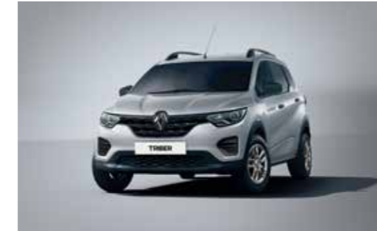
MOONLIGHT SILVER (MP)