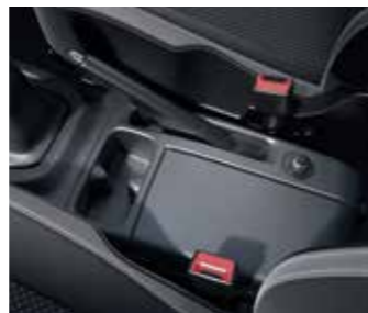
Centre console storage