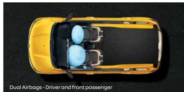
Dual Airbags - Driver and front passenger