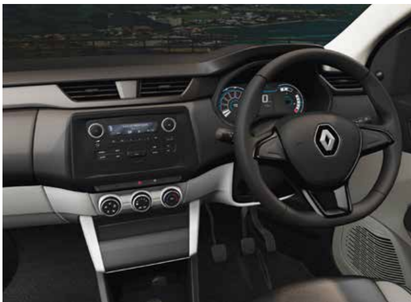
Triber Express interior with R&Go® radio